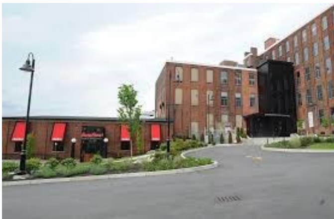
Above: Main entrance of Commonwealth Landing located at 1082 Davol Street

In addition to state incentives, the City of Fall River also approved a Tax Increment Financing agreement for the project, which will allow for increases in tax payments associated with the project to be phased in over time.