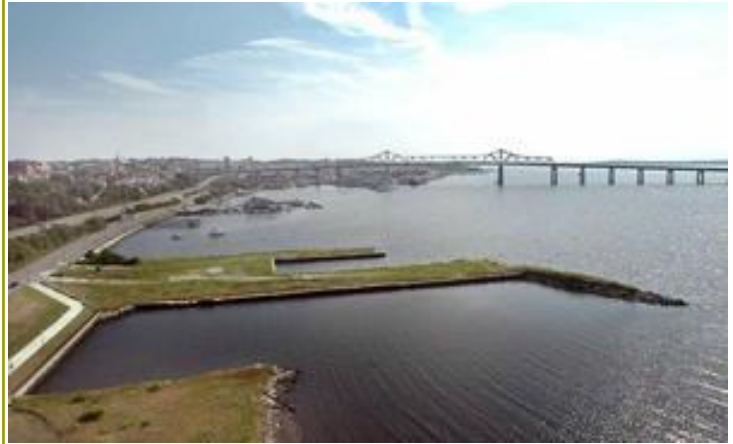
Above: An aerial view of the Fall River City Pier

The Fall River Redevelopment Authority (FRRRA) recently received a Chapter 91 Waterways license from the Commonwealth’s Department of Environmental Protection for the Fall River City Pier project. The license will allow the FRRRA to move forward with improvements, namely construction of seawall pilings to stabilize the pier as well as the 3 feet of fill.