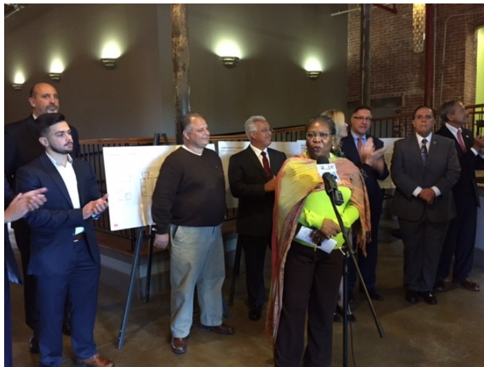
Above: Undersecretary Kornegay addresses the crowd at Commonwealth Landing