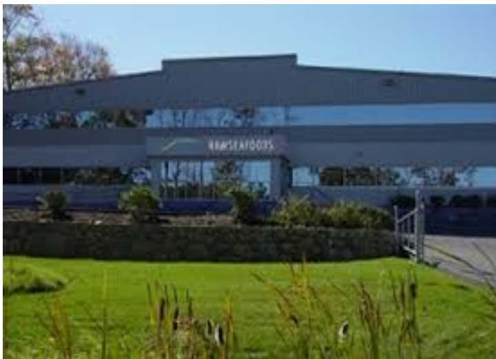
Above: Raw Seafoods located at 481 Currant Road, Fall River, MA

Raw Seafoods' expansion comes on the heels of the Blount Fine Foods expansion, a neighbor of Raw Seafood, as well as the Matouk expansion, which also took place in the Fall River Industrial Park. We commend these companies for their success and dedication to strengthening the Fall River business community.