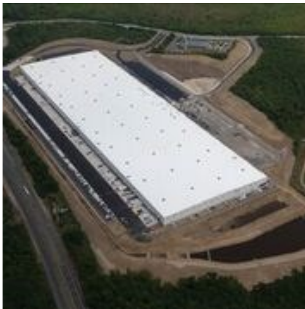
Left: Aerial photo of the Amazon Fulfillment Center located on Innovation Way in the Fall River Industrial Park

Amazon has been working closely with the Fall River Career Center (FRCC), so all inquiries should be directed to the FRCC at 508-730-5000.