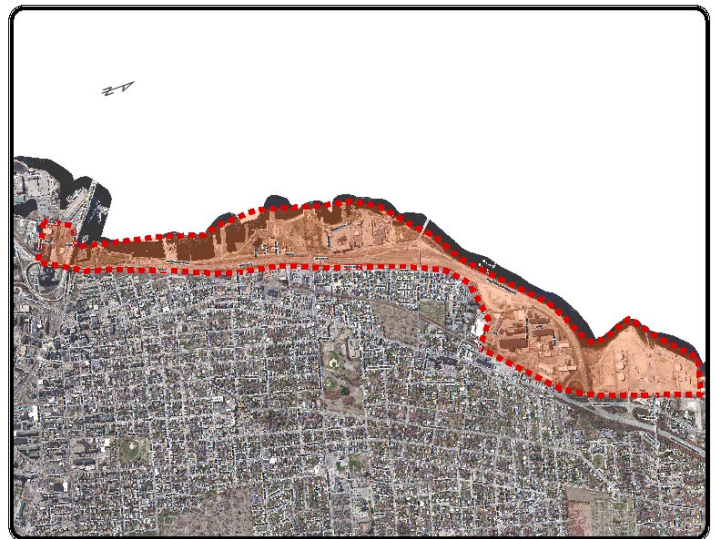
Above: Aerial of the Waterfront Urban Renewal Plan Area

The Cecil Group anticipates the Urban Renewal Planning process will take 10-12 months to complete.